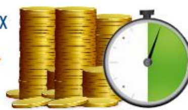
Cost of Ownership reduces by almost 40%

Go-To-Market Timeline shrinks by almost 30%